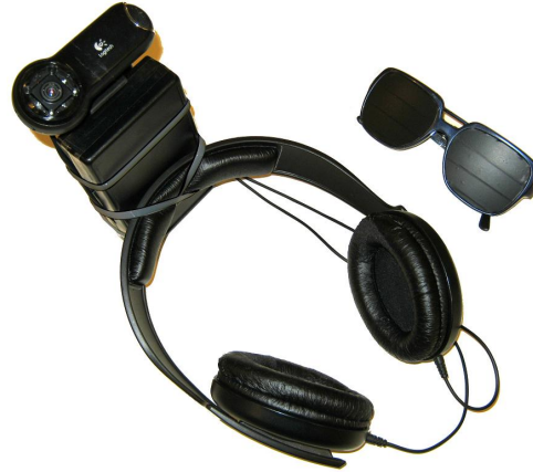
Figure 3. Portable Human Soccer Controller

wireless LAN, USB ports, audio I/O and several GPIOs. For visual perception a USB webcam is connected. The camera is fixed to an IMU module to measure its orientation. Part of the software previously developed for FUManoids kid size team is ported and adapted to match the new architecture.