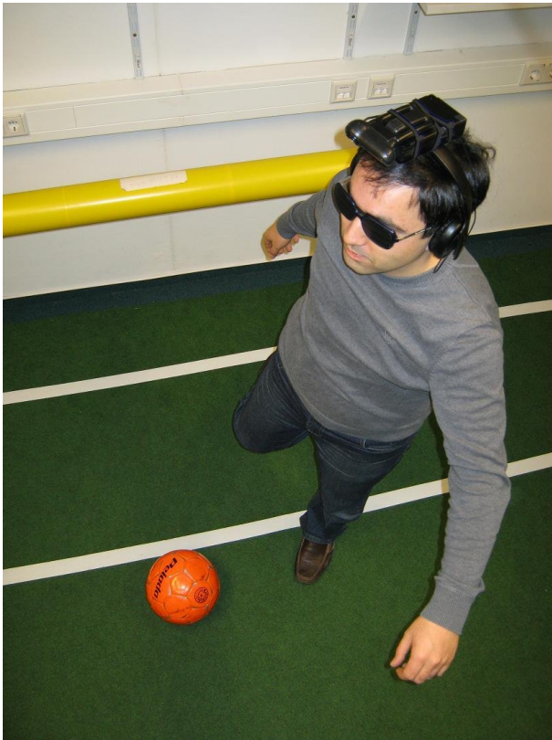
Figure 1. A human agent wearing the soccer controller