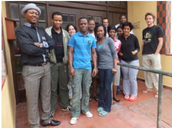
January intake students with AIMS Tutors

The January 2012 intake of Post-graduate Diploma students submitted their final essays by noon on Friday 26 October. Oral presentations are set to take place from 6 to 8 November. The students were supervised by academics from UCT, the AIMS Research Centre and AGH Krakow.